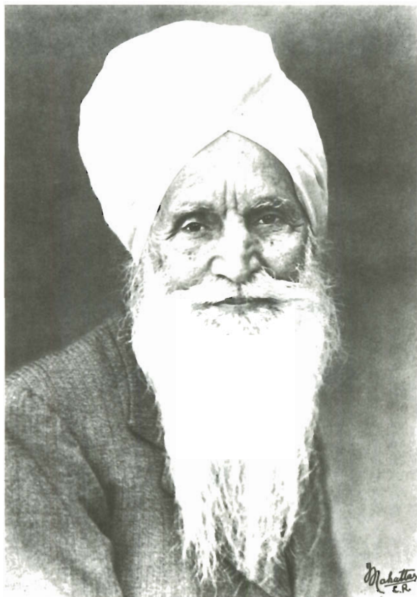
BABA SAWAN SINGH JI MAHARAJ (1858—1948)