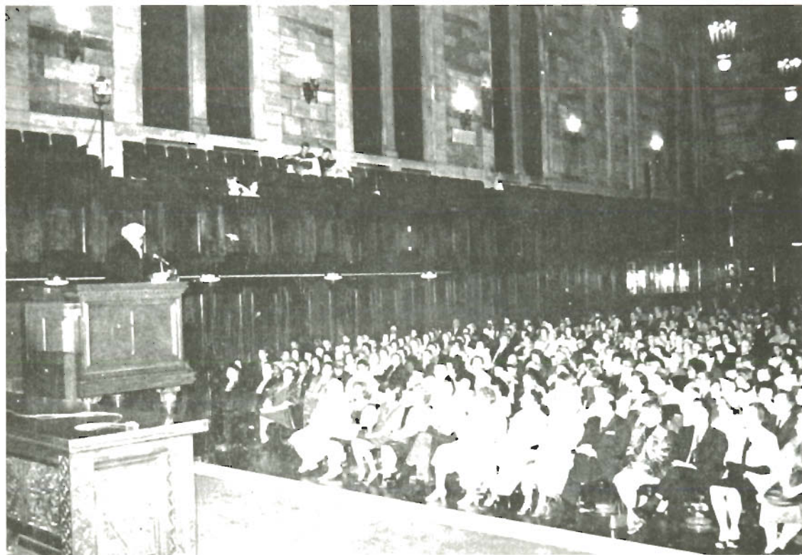
SATGURU KIRPAL SINGH JI IN GRAND RAPIDS, MICHIGAN, U.S.A.